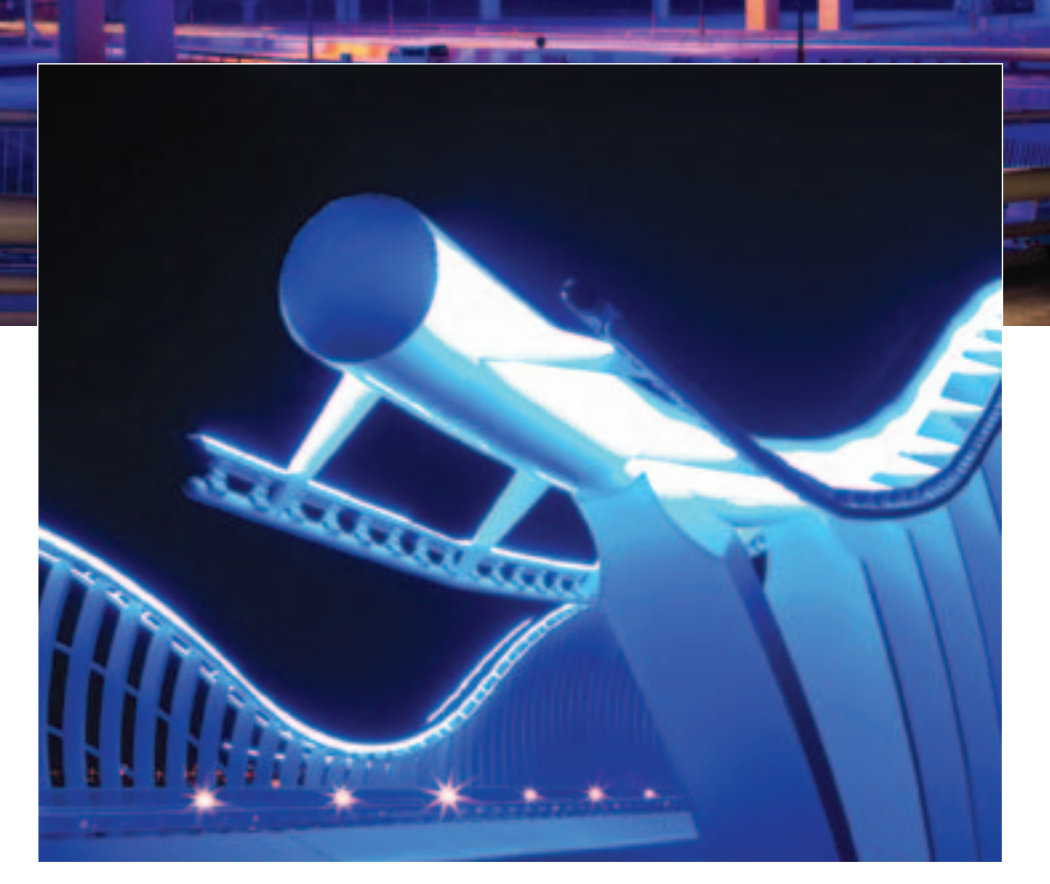
Meydan VIP Bridge, Meydan City, Dubai, United Arab Emirates